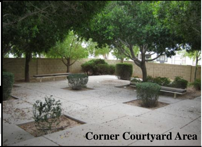
Corner Courtyard Area